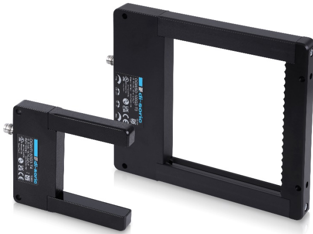
Figure 1: di-soric frame light barriers are ideally suited for counting processes and area detection. The high resolution and ultra-fast reaction time enable process-reliable solutions.